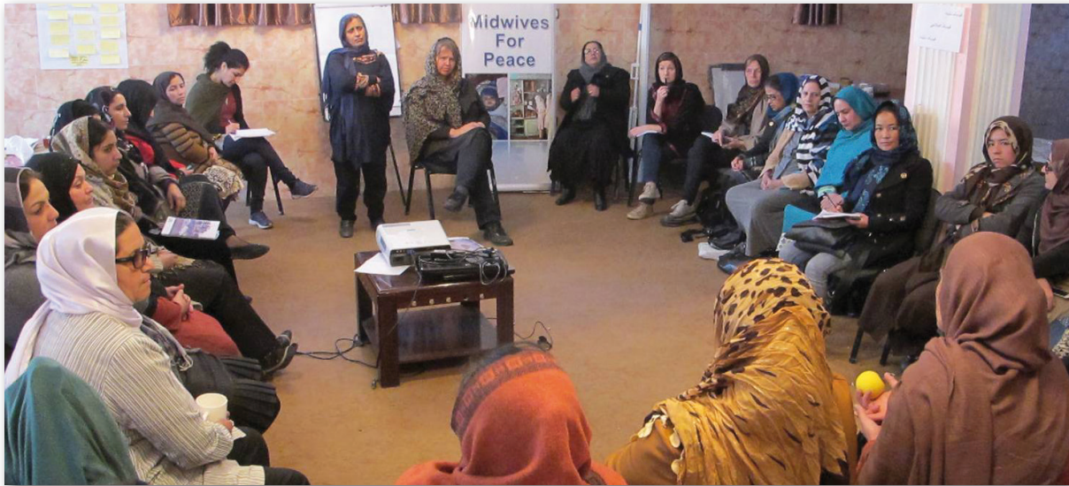
Peace Circle at Midwives for Peace workshop in Kabul november 2014